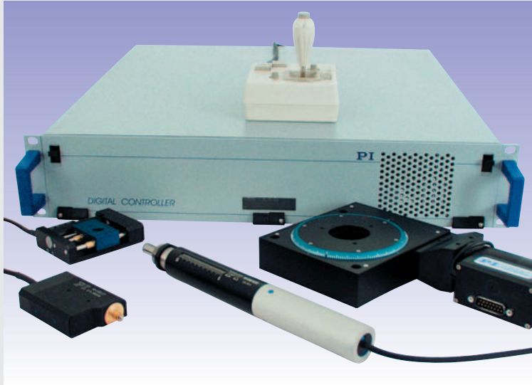
C-848.40 DC-Motor Controller with various PI-stages: M-112.2DG micro-translation stage; M-232.17 DC-Mike, M-062.DG rotary stage and M-235.5DG heavy duty DC-Mike.