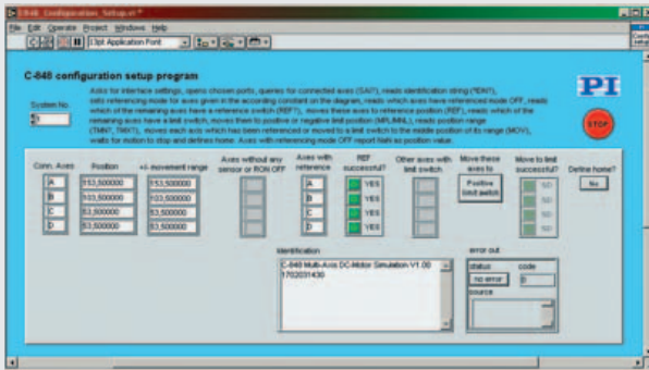
Easy configuration of the C-848 motion controller.