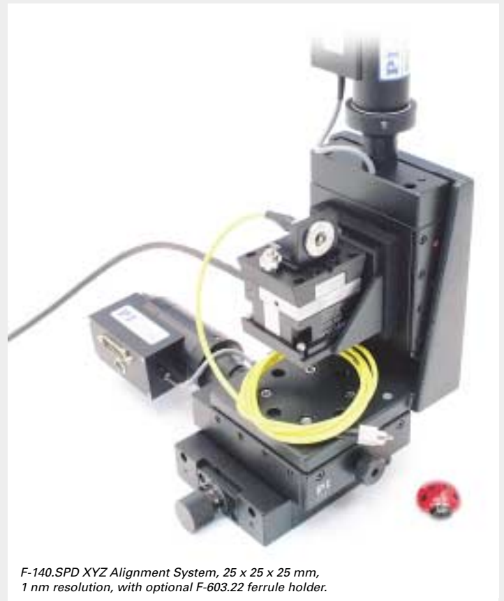
F-140.SPD XYZ Alignment System, 25 x 25 x 25 mm, 1 nm resolution, with optional F-603.22 ferrule holder.