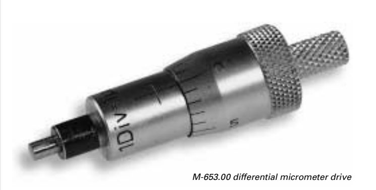
M-653.00 differential micrometer drive