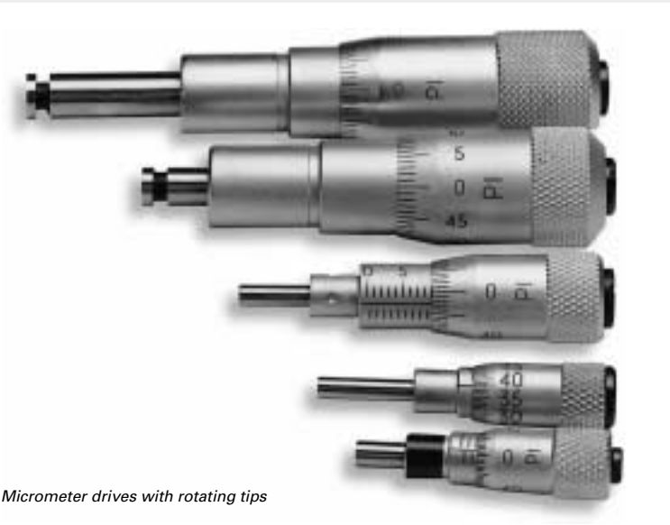
Micrometer drives with rotating tips