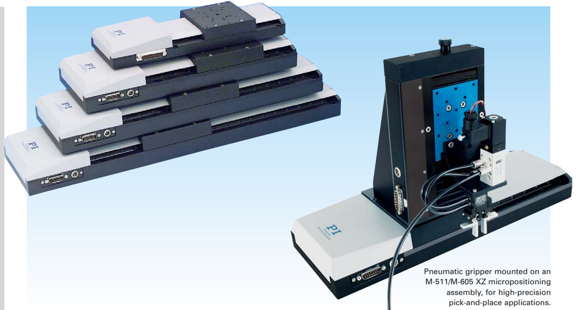
Pneumatic gripper mounted on an M-511/M-605 XZ micropositioning assembly, for high-precision pick-and-place applications.