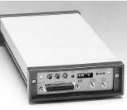
E-661.CP high-speed bench-top NanoAutomation® controller

The E-661.CP module is the compact, bench-top, stand-alone version of the E-612.C0. It comes with a metal case for EMI protection and an external power supply.