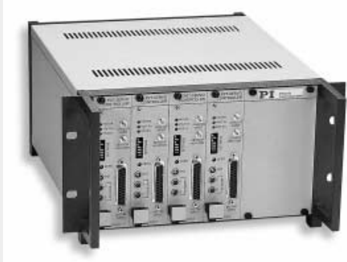
E-501.10 chassis with four E-612.C0 modules

E-612.C0 High-Speed NanoAutomation® Controller, Parallel Port, OEM Board E-661.CP High-Speed NanoAutomation® Controller, Parallel Port, Bench -Top E-501.10 Bench-Top Chassis and Power Supply for 1 to 4 E-612.C0 Modules Custom Designs for Volume Buyers