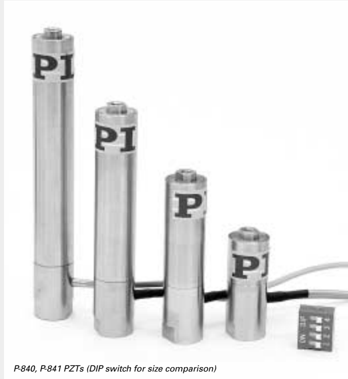
P-840, P-841 PZTs (DIP switch for size comparison)